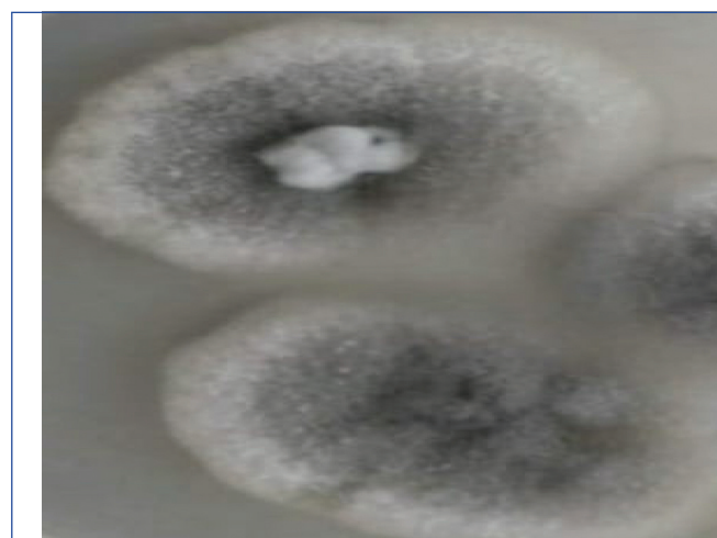
[Table/Fig-2]: White gray floccose colonies of M. romeroi on Sabouraud's dextrose agar (SDA).